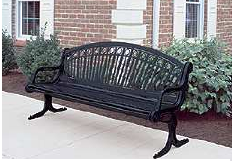
The prototypes for the new benches and trash receptacles have been placed in front of the Library on Morehead St. Go by, take a look and have a seat!

Earlier this year, the Reidsville Downtown Cooperation (RDC) asked its Design Committee to organize an Amenities Task Force to choose the design for the new benches and trash receptacles that will be positioned throughout our downtown. They have completed their task.